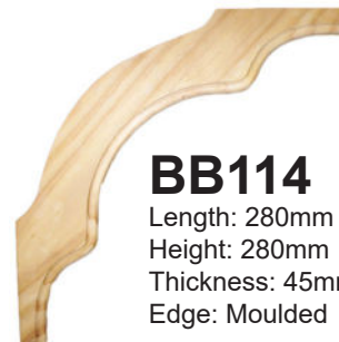
BB114 Length: 280mm Height: 280mm Thickness: 45mm Edge: Moulded