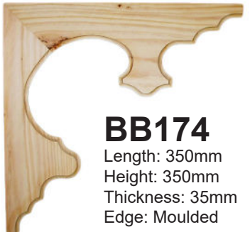
BB174 Length: 350mm Height: 350mm Thickness: 35mm Edge: Moulded