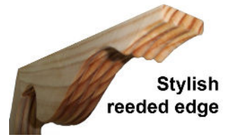
Stylish reeded edge