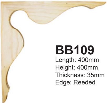
BB109 Length: 400mm Height: 400mm Thickness: 35mm Edge: Reeded