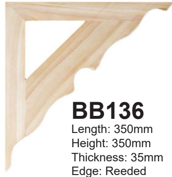
BB136 Length: 350mm Height: 350mm Thickness: 35mm Edge: Reeded