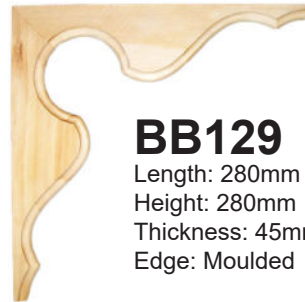
BB129 Length: 280mm Height: 280mm Thickness: 45mm Edge: Moulded