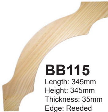
BB115 Length: 345mm Height: 345mm Thickness: 35mm Edge: Reeded