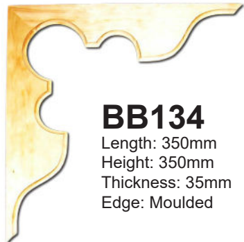
BB134 Length: 350mm Height: 350mm Thickness: 35mm Edge: Moulded