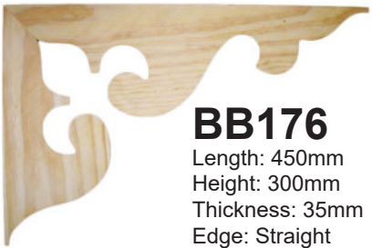
BB176 Length: 450mm Height: 300mm Thickness: 35mm Edge: Straight

We have 9 BB181 motifs available, matching those in the frieze slats