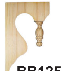
BB125 Length: 140mm Height: 220mm Thickness: 35mm Edge: Straight