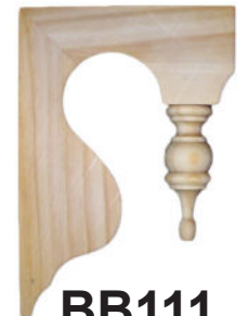
BB111 Length: 175mm Height: 250mm Thickness: 45mm Edge: Straight