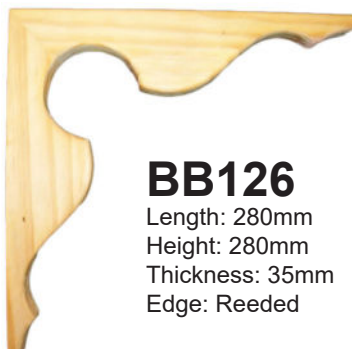
BB126 Length: 280mm Height: 280mm Thickness: 35mm Edge: Reeded