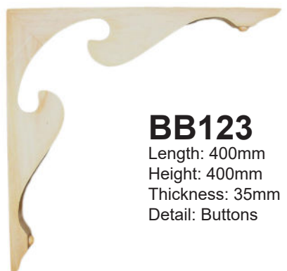
BB123 Length: 400mm Height: 400mm Thickness: 35mm Detail: Buttons