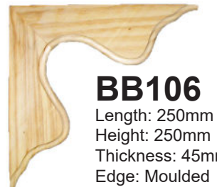
BB106 Length: 250mm Height: 250mm Thickness: 45mm Edge: Moulded