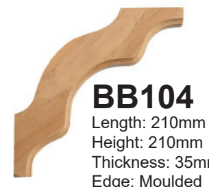
BB104 Length: 210mm Height: 210mm Thickness: 35mm Edge: Moulded