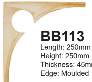
BB113 Length: 250mm Height: 250mm Thickness: 45mm Edge: Moulded