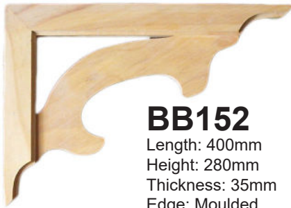
BB152 Length: 400mm Height: 280mm Thickness: 35mm Edge: Moulded