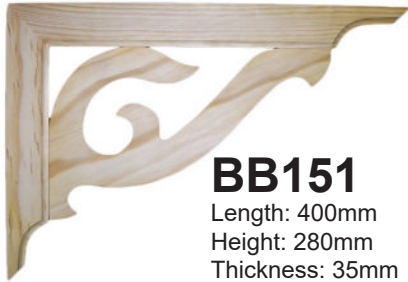
BB151 Length: 400mm Height: 280mm Thickness: 35mm Edge: Moulded